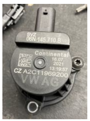
Continental OEM diverter

The location of the factory diverter depends on the vehicle. E.g. on Mk8 GTI models it's found on the turbo and is easily accessible from the top of the engine bay. On the Mk8 R it is mounted to the charge pipe and must be accessed from underneath. In this case, make sure to use axle stands or a hoist. NEVER work under a car supported only with a jack.